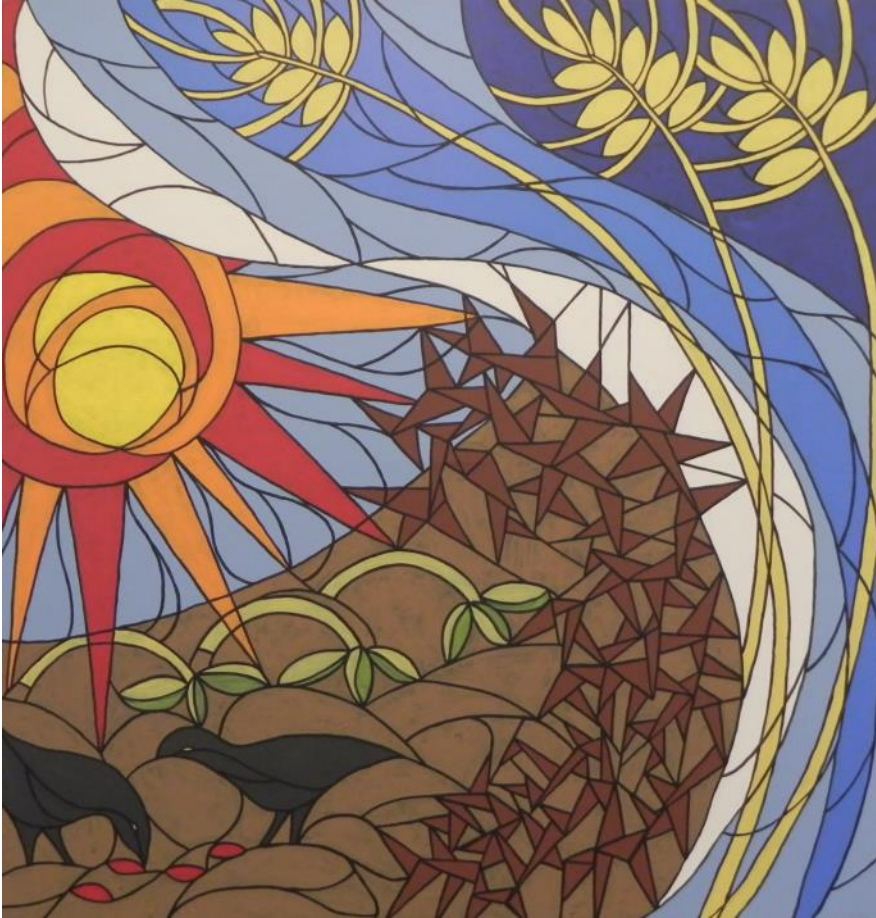
The Parable of the Sower ... art by Adina Henderson

Email westminsterp@wpcportage.org website www.wpcportage.org facebook @westminsterpresbyterianportage